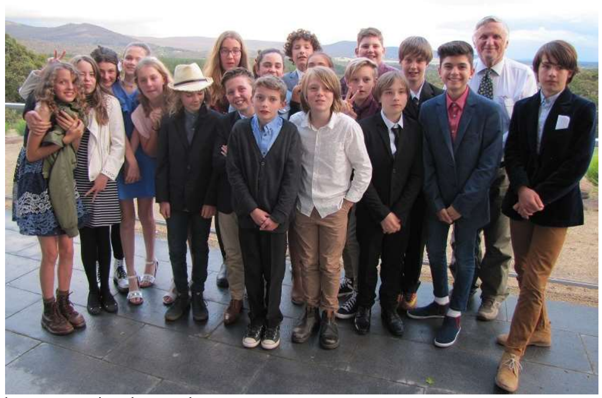
the accompanying photograph.

Towards the end of the year the teaching staff took the 22 Grade 6 students to dinner at the Macedon Wine Room, to acknowledge their forthcoming graduation from primary school. Each student made a short speech, and very generous and gracious they were. It was nice to see young people who are normally running around in old clothes, often smeared with mud, dressed (reasonably) formally and (more or less) fashionably. You can judge for yourself in